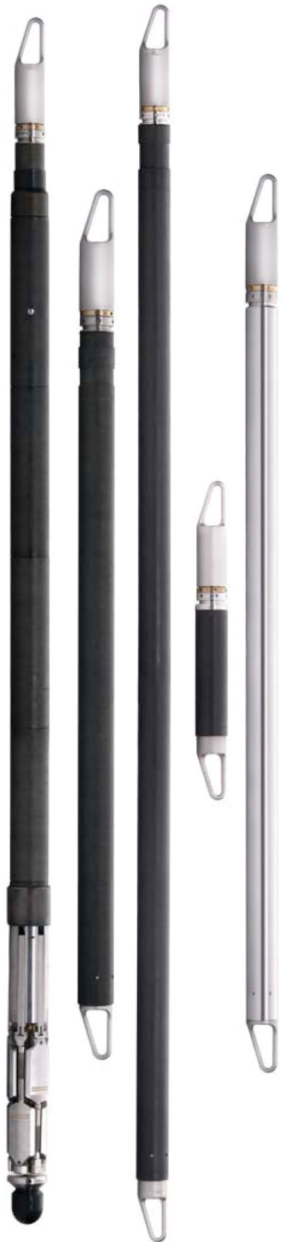
MCI Tool String

The Formation Micro-Conductivity Imager Tool (MCI) provides detailed borehole resistivity image data. Six pads are pushed against the borehole wall by a hydraulic actuating device. The pads closely and consistently make contact with the borehole wall, which is essential to obtaining high quality image data.